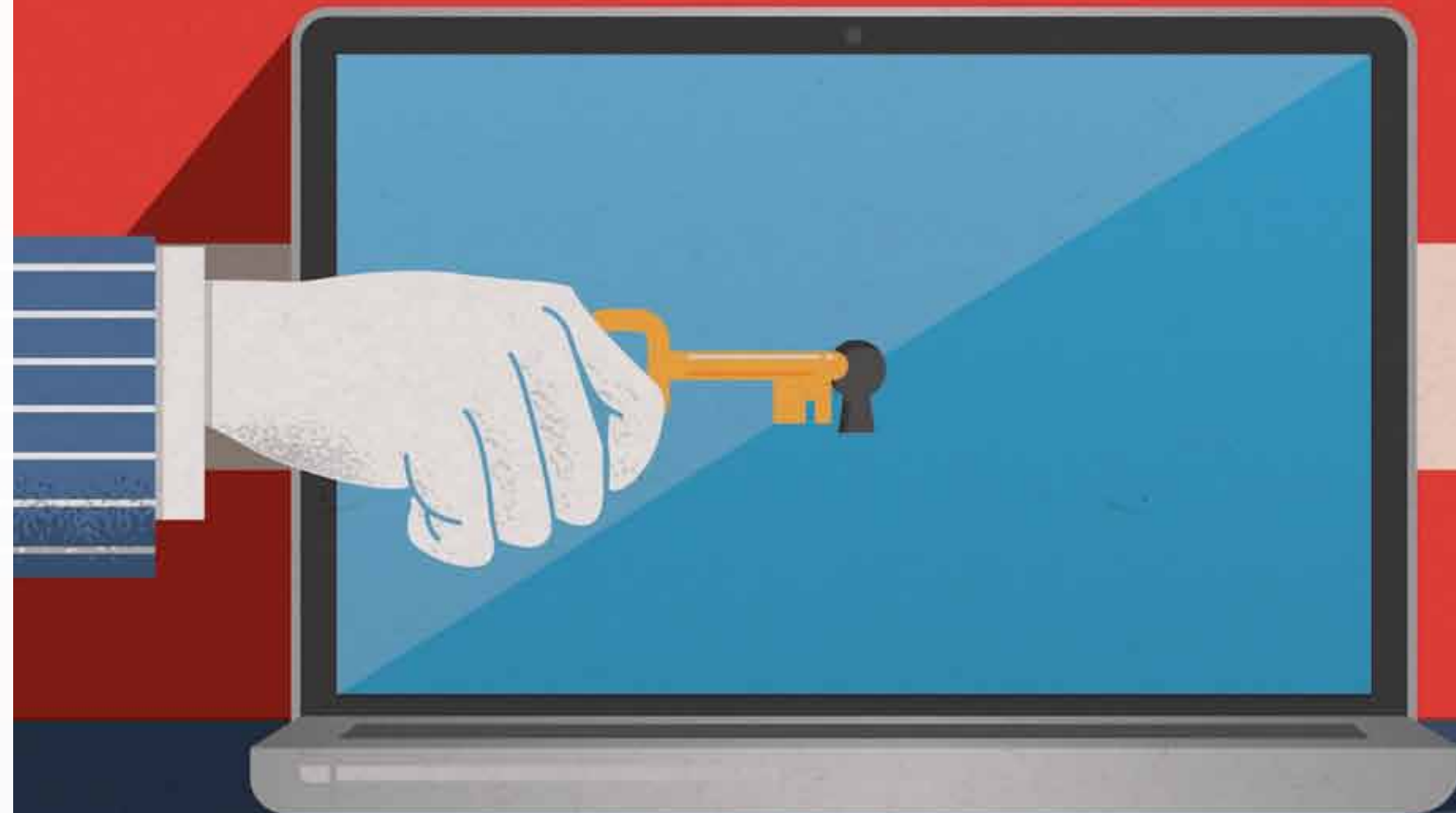
ILLUSTRATION BY ERICK MONTES

The FBI and U.S. Department of Justice pushed for the creation of technical “backdoors” to unlock data for criminal investigations. CPJ called on Western governments to safeguard encryption in order to protect the integrity of journalistic communication, and keep digital data safe from malicious actors and authoritarian governments.