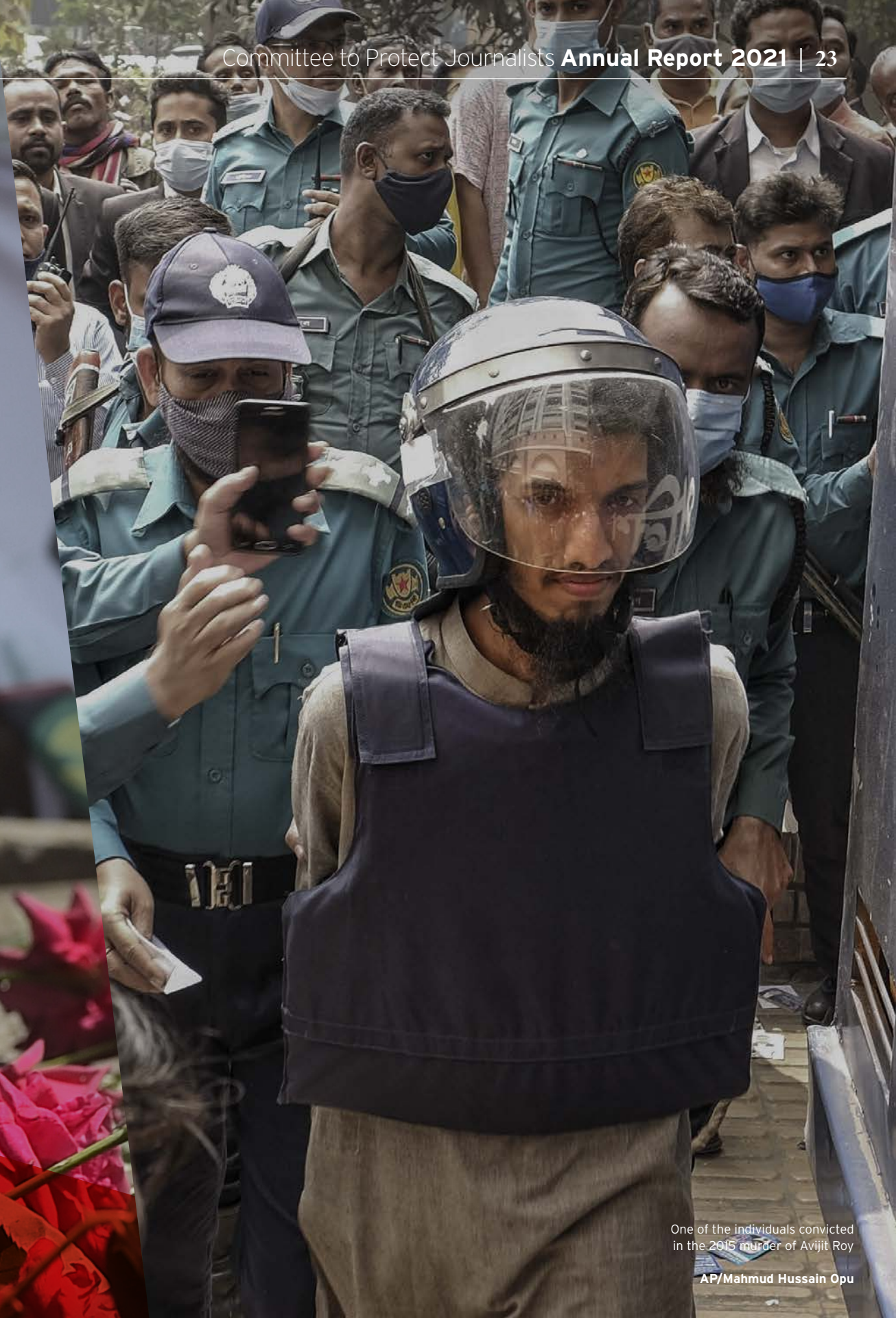
One of the individuals convicted in the 2015 murder of Avijit Roy

In February, a Bangladeshi court convicted six individuals for their involvement in Roy's murder. Five of them were sentenced to death, and the sixth to life in prison. They are appealing their convictions. CPJ opposes the death penalty for those convicted of murdering journalists and urged Bangladesh to "hand down humane sentences to these defendants on their appeals."